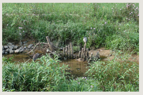
River revitalization Enhancement of Existing River Sections – Phase 1 – Investigation