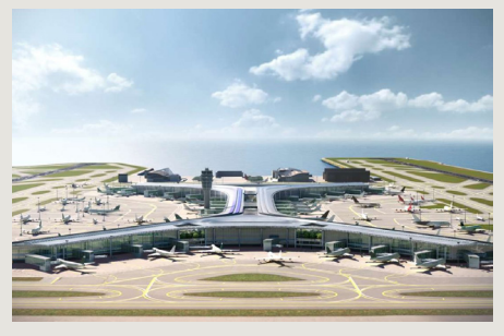
Infrastructure development Expansion of Hong Kong International Airport